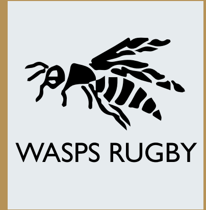
1985-89 Winnipeg Wasps Third Division – Team