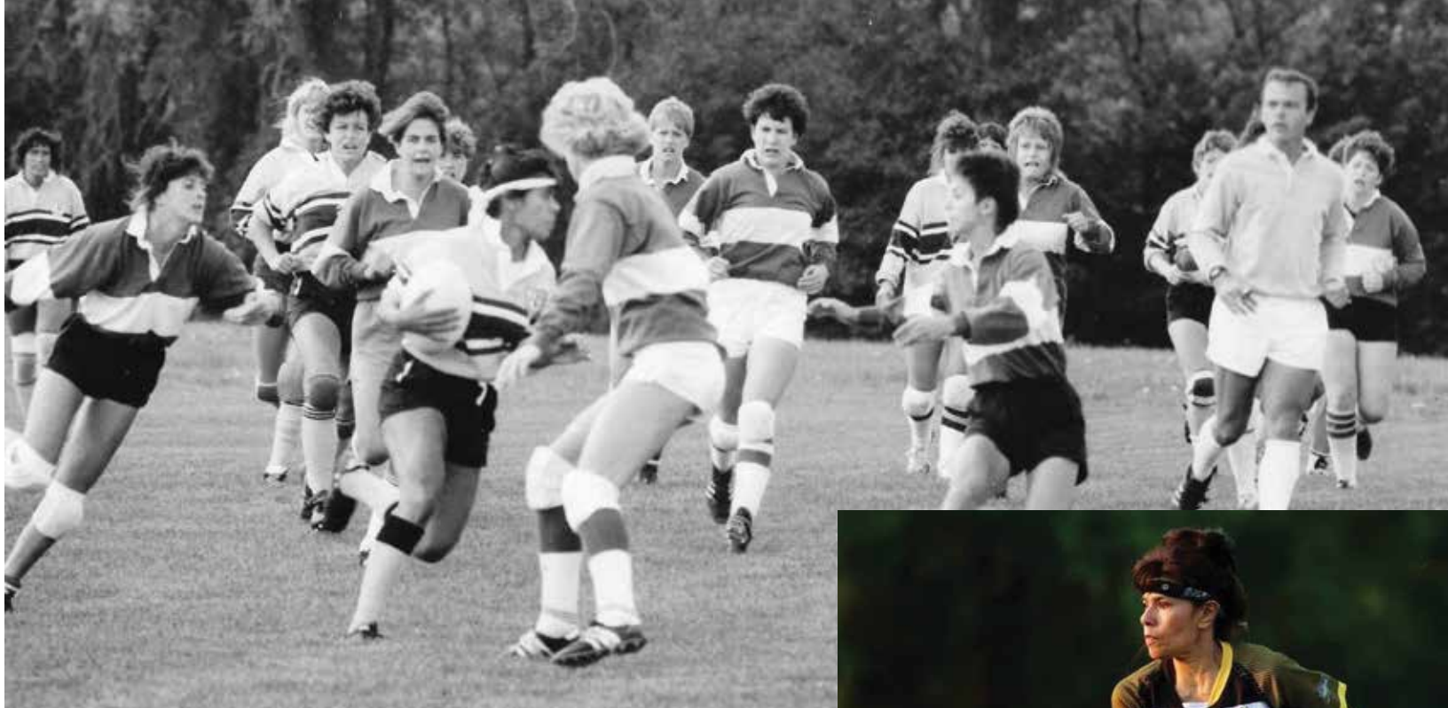
1988, training in Montreal before the team headed to Saranac Lake, New York for a Can-Am game.