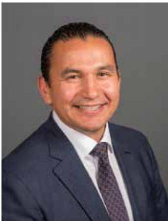
The Honourable Wab Kinew Premier of Manitoba

Thank you to the Manitoba Rugby Hall of Fame for your continued efforts to strengthen and promote rugby in our province. To everyone attending tonight's event, I wish you a wonderful evening of celebrating excellence in Manitoba sports.